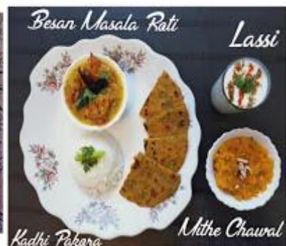
Shireen B.A III Yr